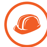
ESSENTIAL SKILLS FOR SAFE HANDLING