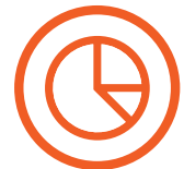
DIVERSE INDUSTRY SECTOR SOLUTIONS