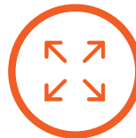
EXPERIENCE IN CONFINED AREAS

For further information on the Radius Group lifting assurance services, contact us on +44 (0)1604 622 865