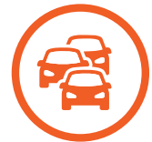
INTEGRATED TRAFFIC MANAGEMENT PLANS