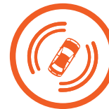
COMPREHENSIVE VEHICLE SWEEP PATHS